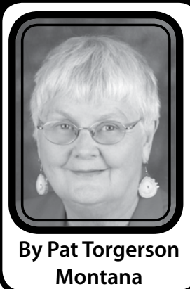
By Pat Torgerson Montana

Oats contain high levels of complex carbohydrates which have been linked to reducing the risk of cancer and the better control of diabetes. Oat bran contains glucans, a cholesterol lowering chemical through a mechanism still unclear to the scientific community. This soluble fiber in oat bran may also aid in regulating blood sugar levels by forming gels that slow the absorption of glucose sugar in the intestinal tract.