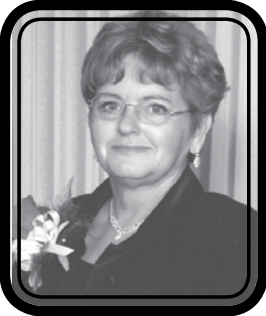
By Pam Potthoff Nebraska