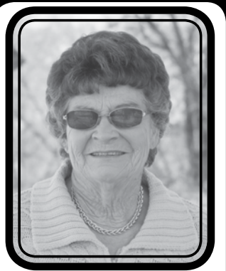
By Jean Wach Nebraska

The condition of the hard winter wheat crop in the Plains will be a major concern once weather begins to warm up and the crop breaks dormancy. With the dry weather at seeding time, and the continued drought into winter, crop conditions were very poor and tiller formation was limited in many areas.